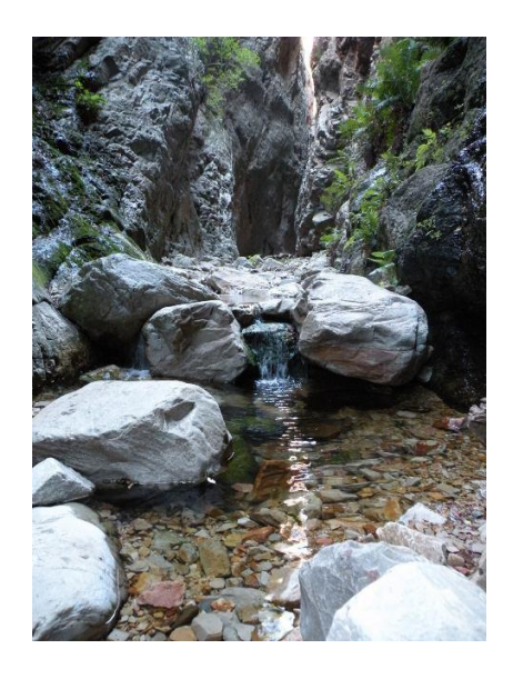
Waterkloof hiking trail